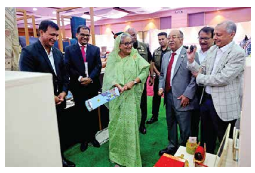
FBCCI President Mr. Mahbubul Alam attended the inaugural ceremony of the 11th National SME Product Fair was held at BICC in the Capital on May 19, 2024.

Honorable Prime Minister of Bangladesh H.E. Sheikh Hasina, as the Chief Guest, inaugurated the weeklong Fair to showcase products made by local small and medium enterprises.