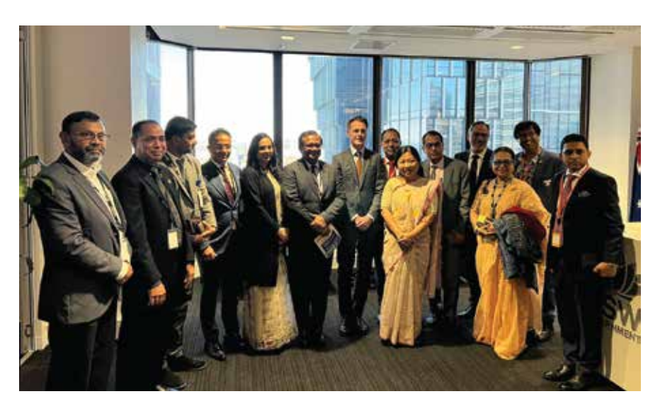
trade and business between the two nations.

They had a fruitful discussion on strengthening bilateral trade between Bangladesh and Australia. Both reiterated their commitment in strengthening